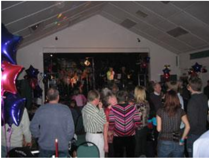
Local Charitable events raising funds for good causes