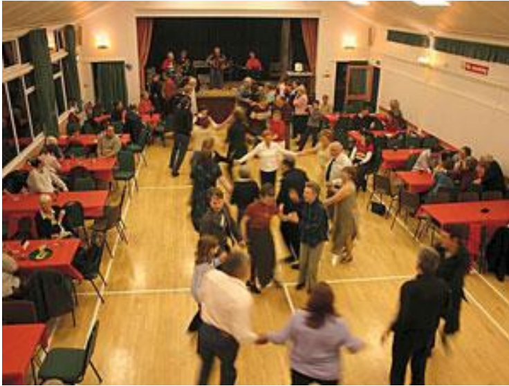
Learn to dance at the HWMH