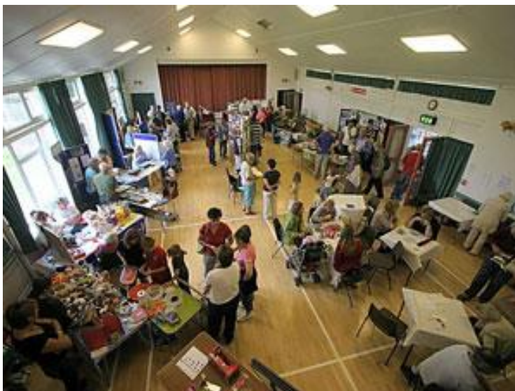
HWMH users open day